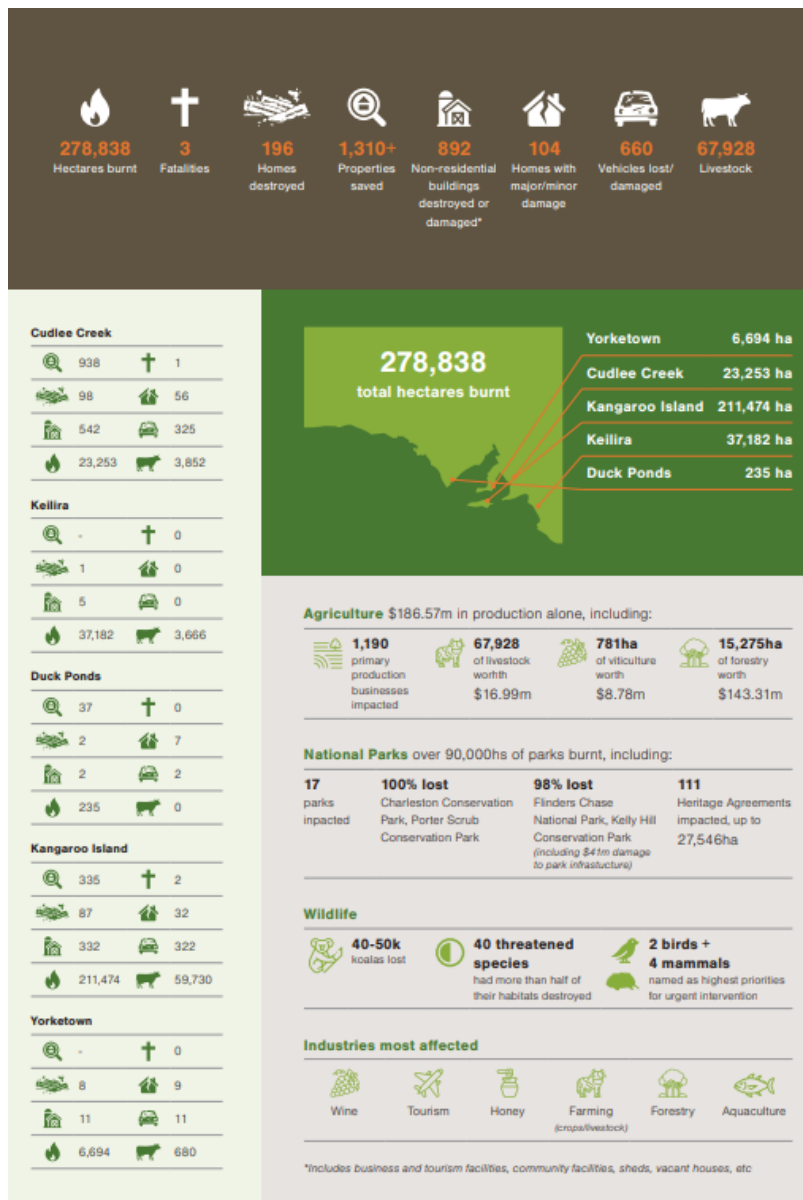
Bushfire Impact data 2019/2020 from Keelty Review